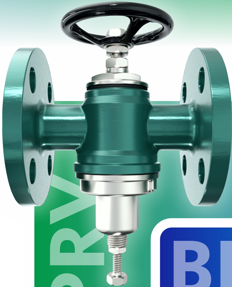
PRESSURE REDUCING VALVE [FDI - PRV - 704]