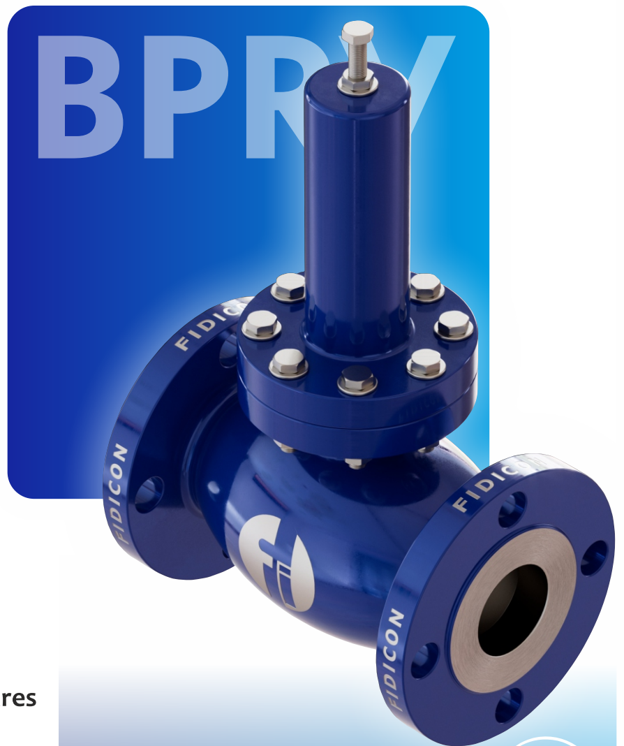
BACK PRESSURE REDUCING VALVE [FDI - BPRV - 705]